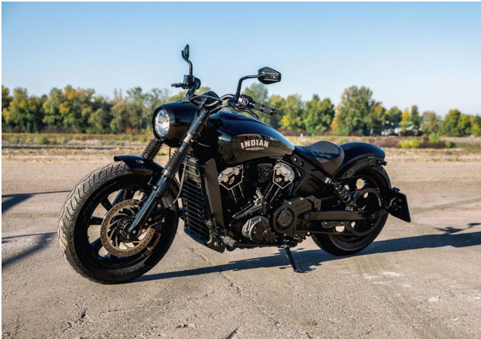
Fully customized Indian Scout Bobber 2018 by WUNDERKIND-Custom