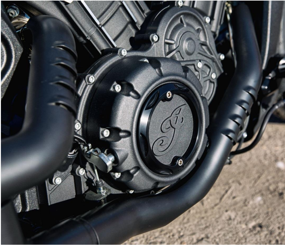
Cover for generator, black | EUR 89,90 per item