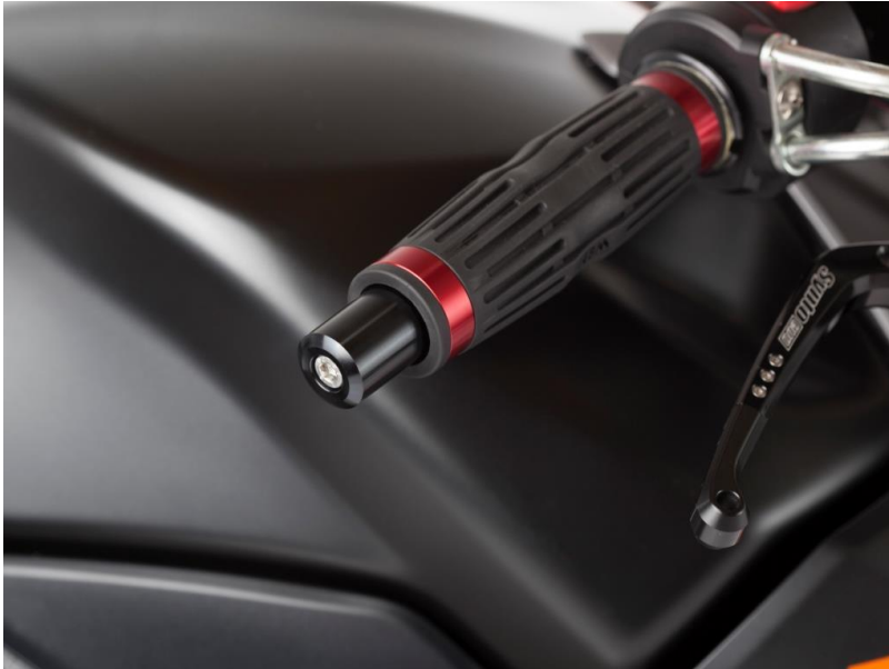
Picture 3 of 4: Broadening ,largo' – universal for all 22,2 mm handlebars