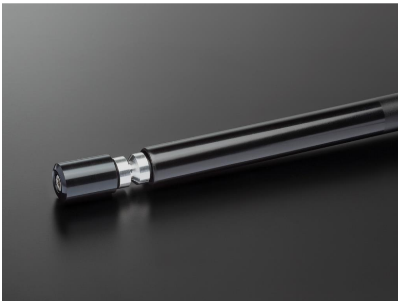
Picture 1 of 4: Handlebar lengthening of 30 mm each side (total 60 mm)