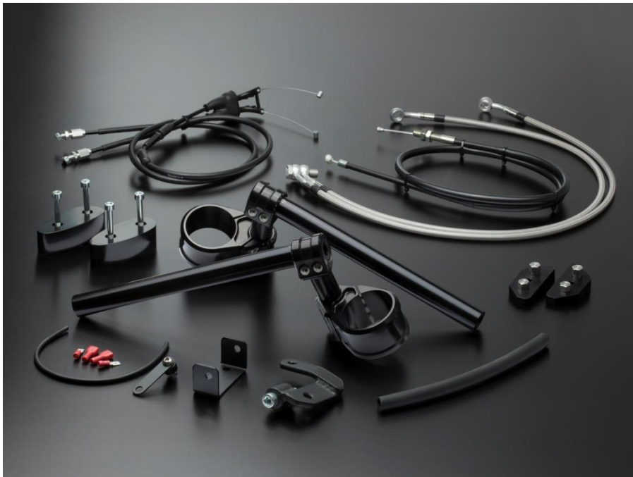
Pic 3 of 7: Multiple clamping for highest safety