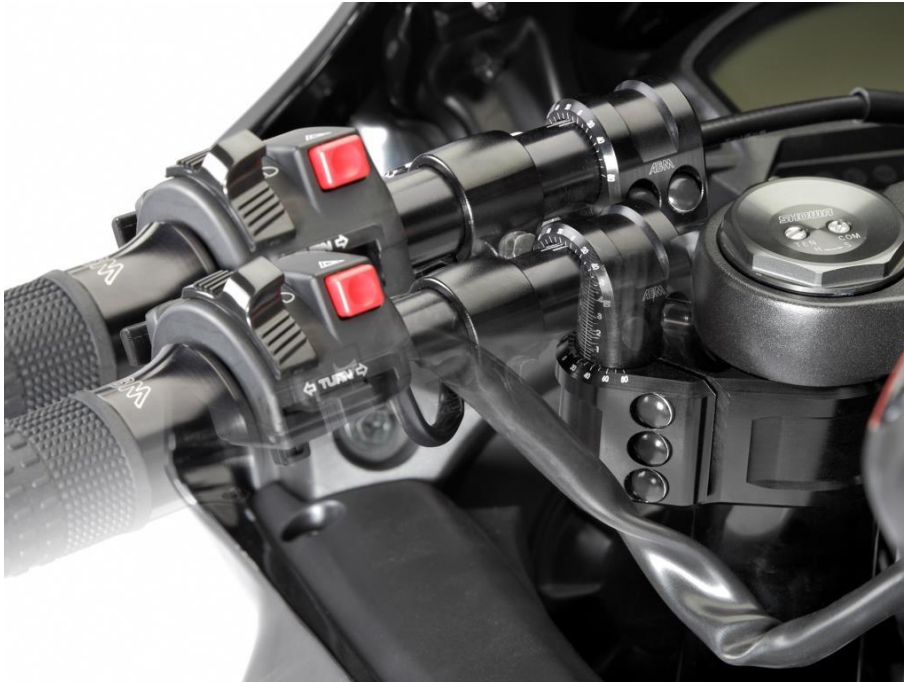
Pic 7 of 7: Depending on motorbike and clip on type different height adjustments