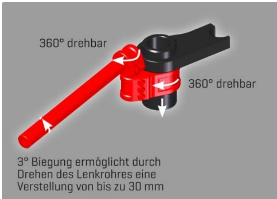
Pic 5 of 7: Position variously customizable to the driver