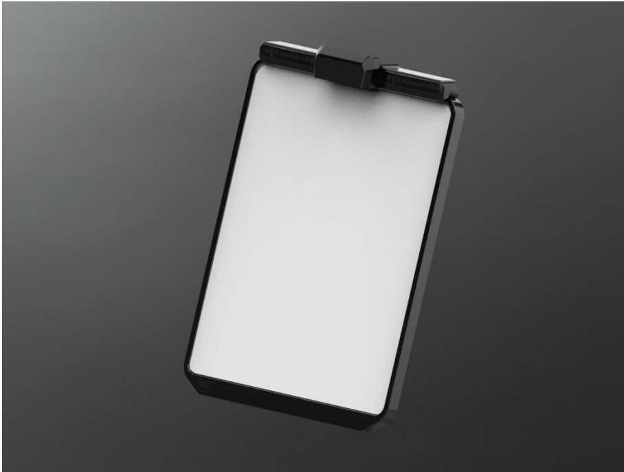
Pic 4 of 5: Example I: Installed, universal plate number frame