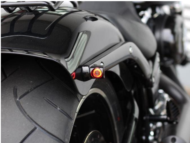
Picture 4 of 5: E-tested LED unit can be replaced separately without exchanging the whole housing