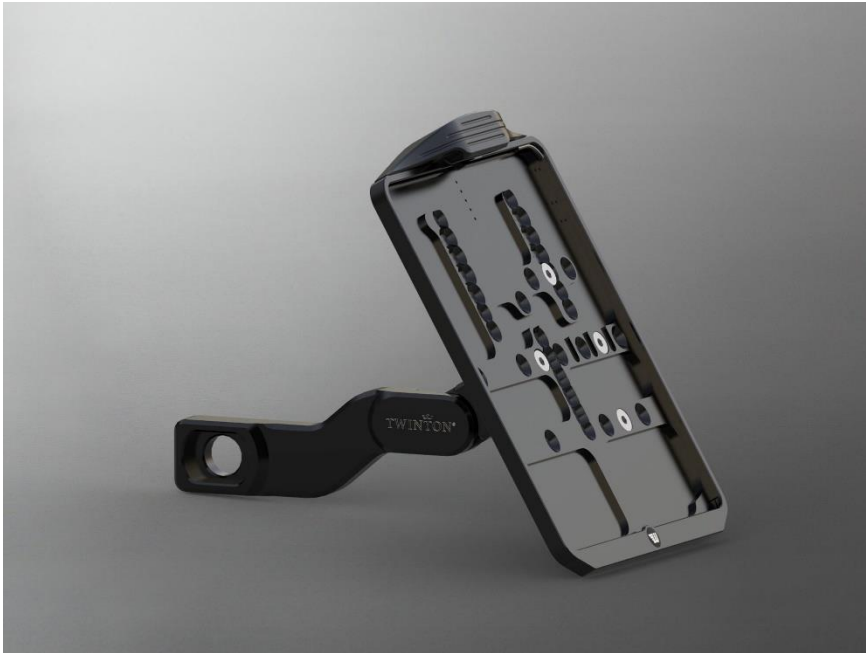
Installed TWINTON® license plate holder - side mount